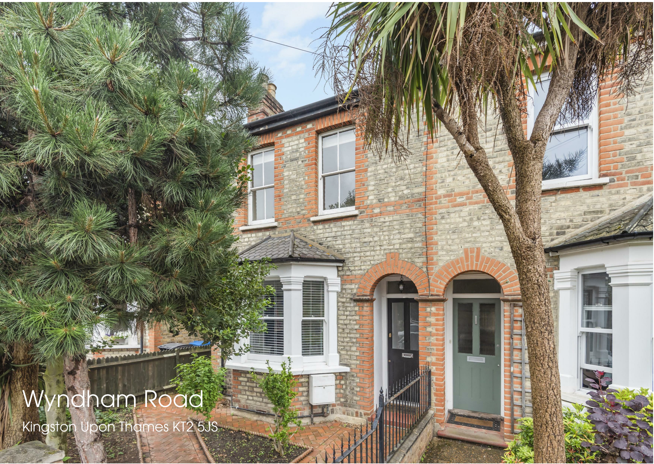
Wyndham Road Kingston Upon Thames KT2 5JS